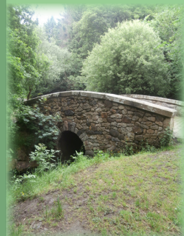
Small bridge over burn