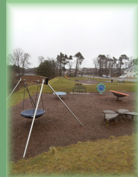
Adventure Play Area