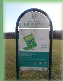
Map and information board