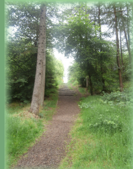
Footpath & timber stepping