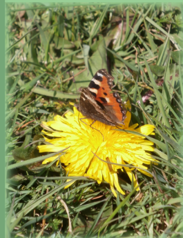
Small Tortoiseshell Butterfly