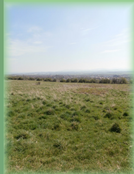
View over Broxburn