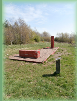
Kirkhill Pillar Project