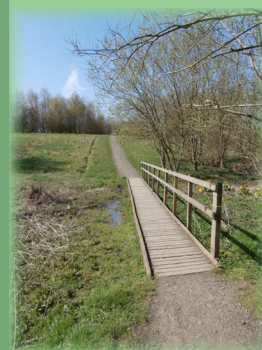
Boardwalk over stream