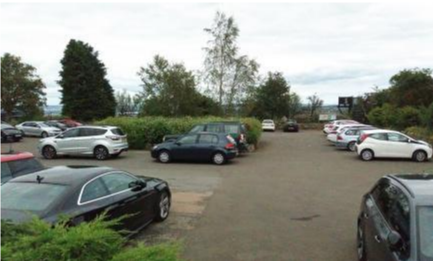
Animal Attraction Car Park