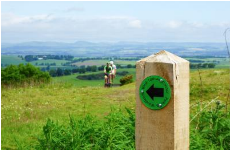
Green Route - unsurfaced paths at Hillhouse