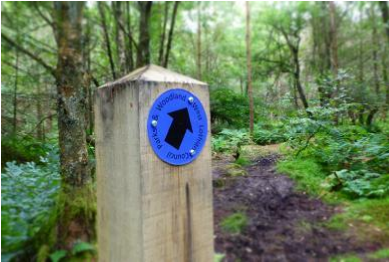
Purple Route - paths can be muddy