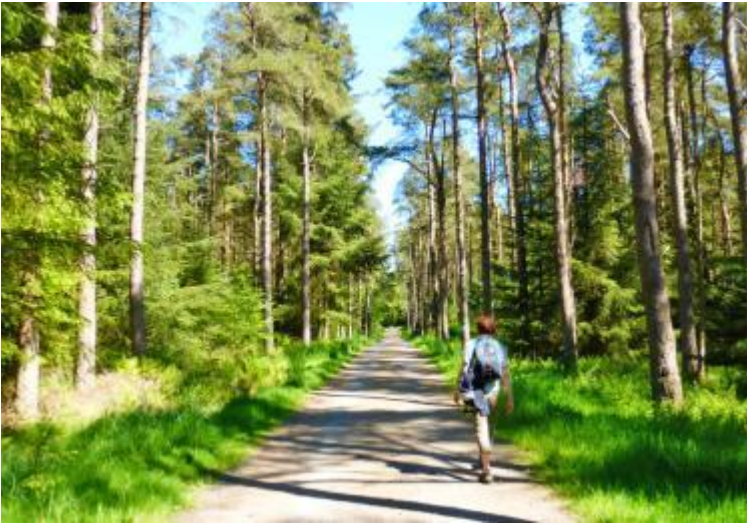
Orange Route - surfaced path