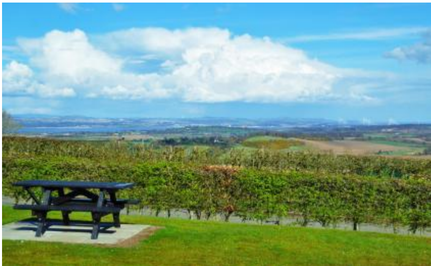
Additional seating next to Visitor Centre