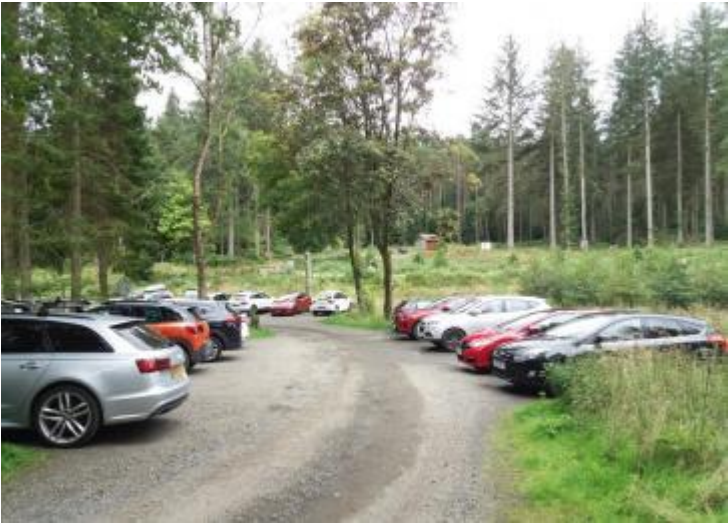
Lochside Car Park