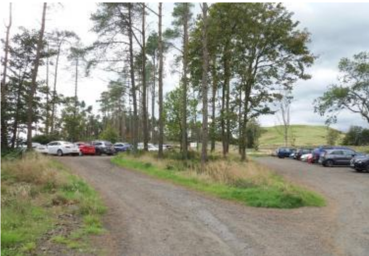
Cockleroy Car Park