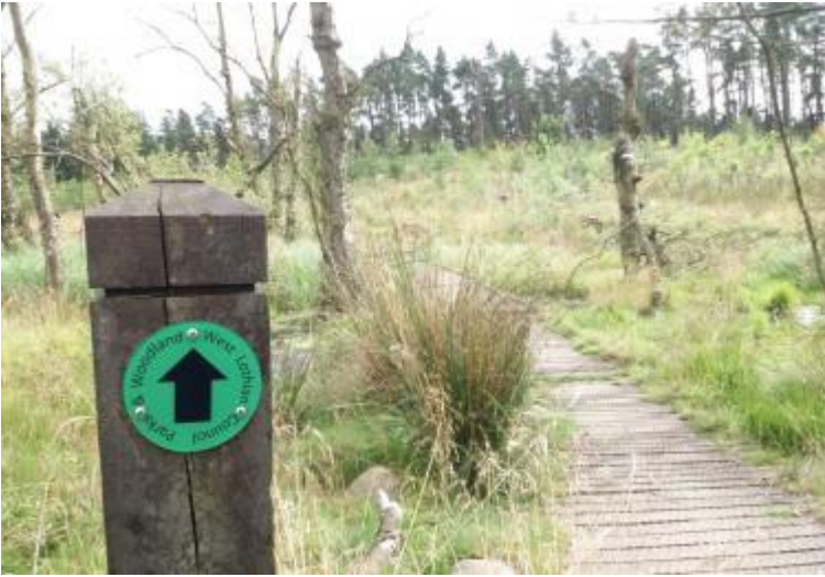
Green Route - boardwalk and steps