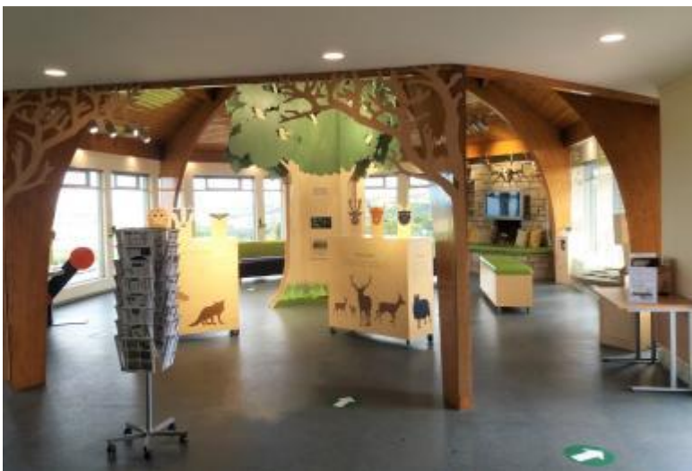
Visitor Centre & Viewing Area