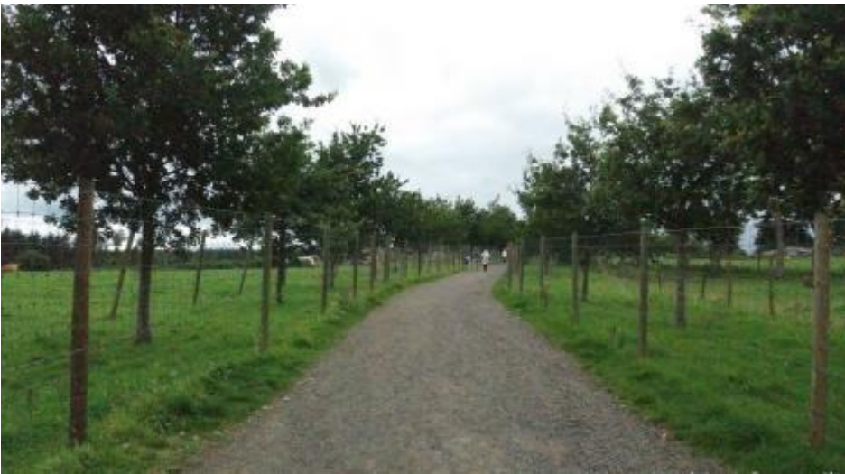
Animal Attraction paths (on a hill)