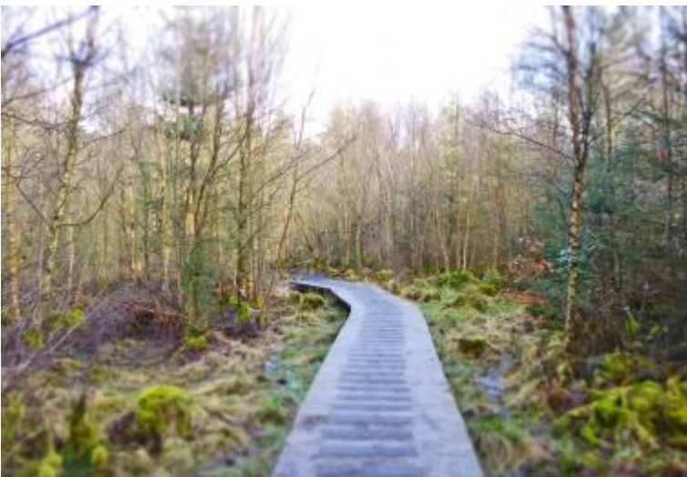
Purple Route - boardwalk section