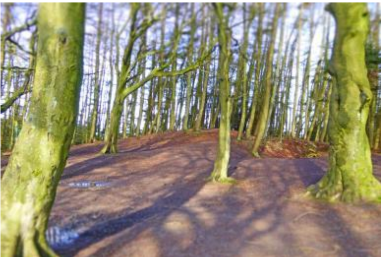
Purple Route - unsurfaced woodland paths