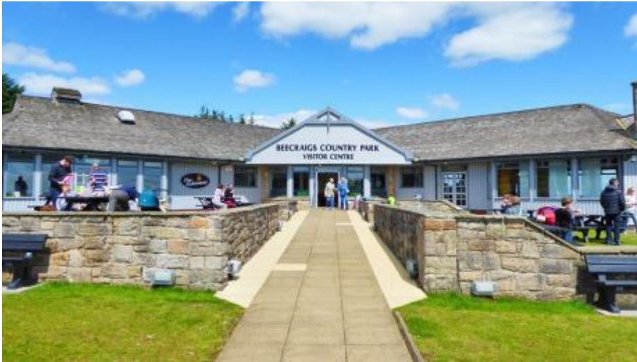
Visitor Centre entrance