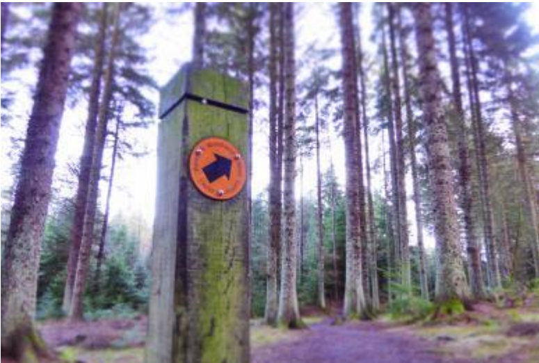
Orange Route - surfaced path