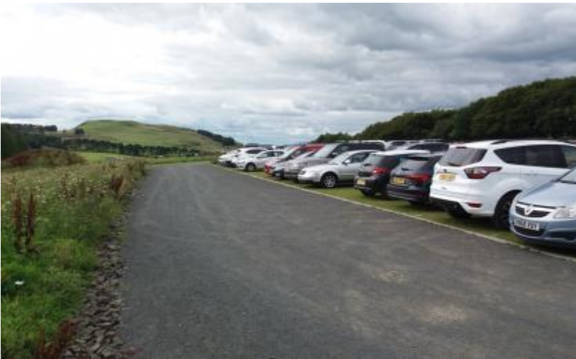
Hillhouse Car Park