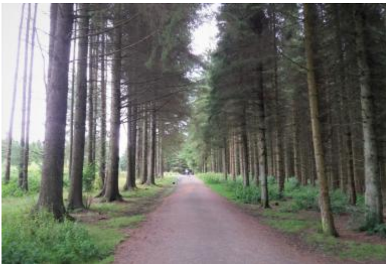
Green Route - surfaced forest tracks