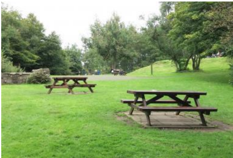
Balvornie picnic area