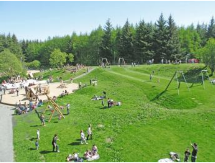
Beecraigs Play Area