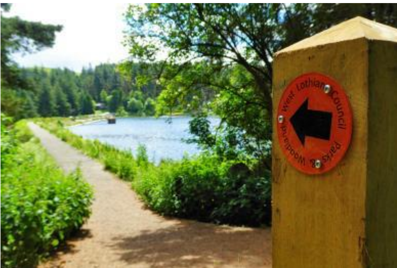
Orange route by loch. NB flight of steps on loch dam