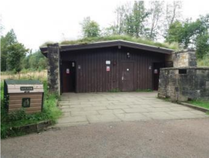
Balvornie Public Toilets