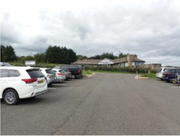
Visitor Centre Car Park