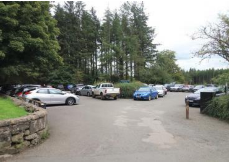
Balvornie Car Park