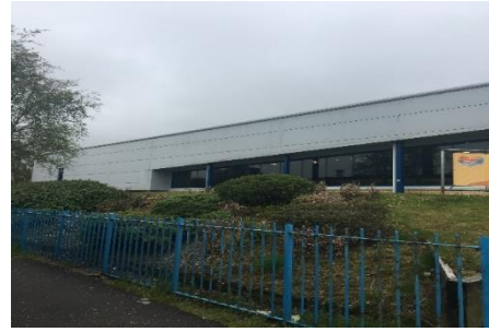
Make a splash in me!