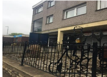
Dig, dig dig....it may not be gold you find