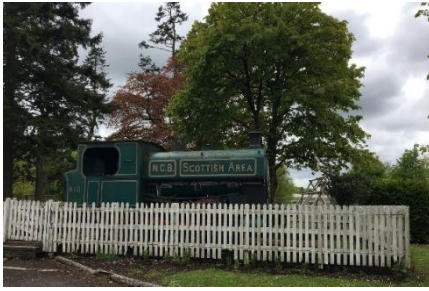
A train in a place where you can walk!