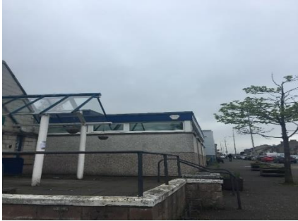
Every picture tells a story. Where am I?