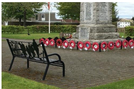
Remember the lost soldier

How many of the Photo's below can you see when you are outside? This might be on your way to nursery or school, when you are out for a walk. Write your answer in the space provided and return your completed sheet to Whitburn Library for your chance to win a Goodie Bag!