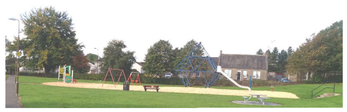
Glebe Park Play Area, Uphall

Council revenue and capital investment in open spaces is limited and currently allows the council to keep assets in a 'fit for purpose' condition only (see section 6.2 for definition). In order to maximise available resources to make improvements and to ensure West Lothian open spaces deliver what local communities want, the council will often work with external organisations and the public to secure external grants and volunteering opportunities to improve open spaces.