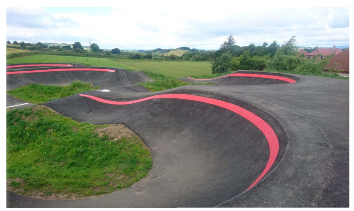
Bridgend Pump Track