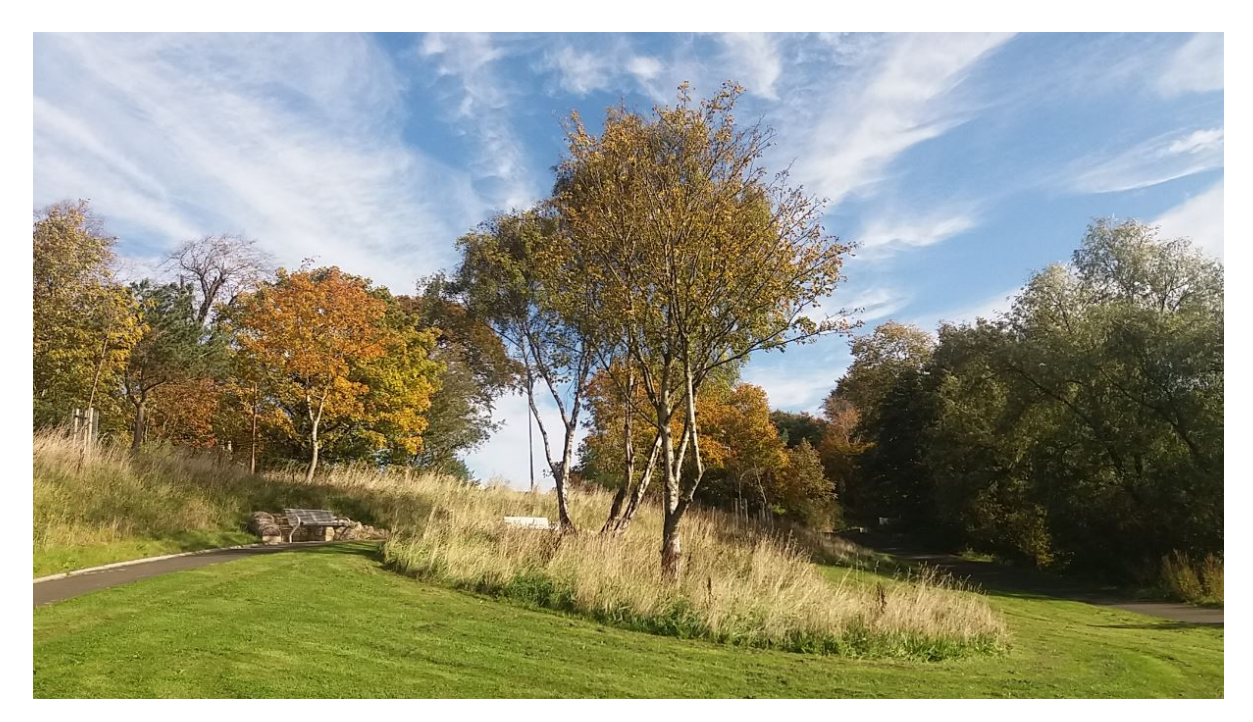
Almondvale Park, Livingston