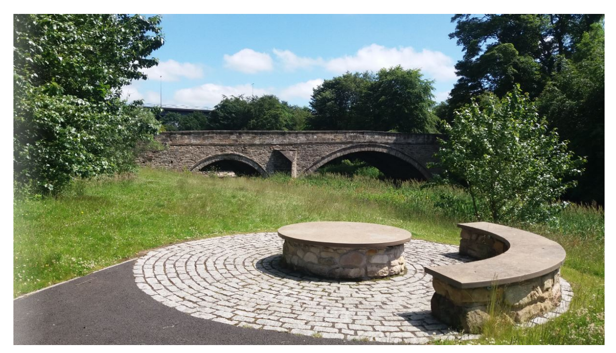
Almondvale Park, Livingston