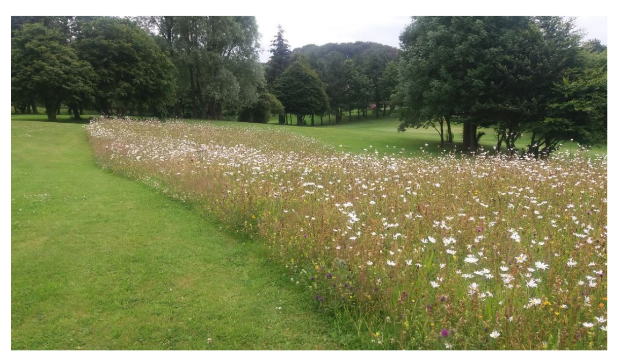
Balbardie Park, Bathgate

In order to measure the value of open space and ensure that it is protected, enhanced, and expanded, where appropriate, it is important to set clear standards. PAN 65 sets out how local authorities should prepare open space strategies and audits and advocates a 'standards based approach' for the assessment of open space provision and need. PAN 65 suggests that standards should contain three elements: quantity, quality, and accessibility. West Lothian Council has adopted this approach.