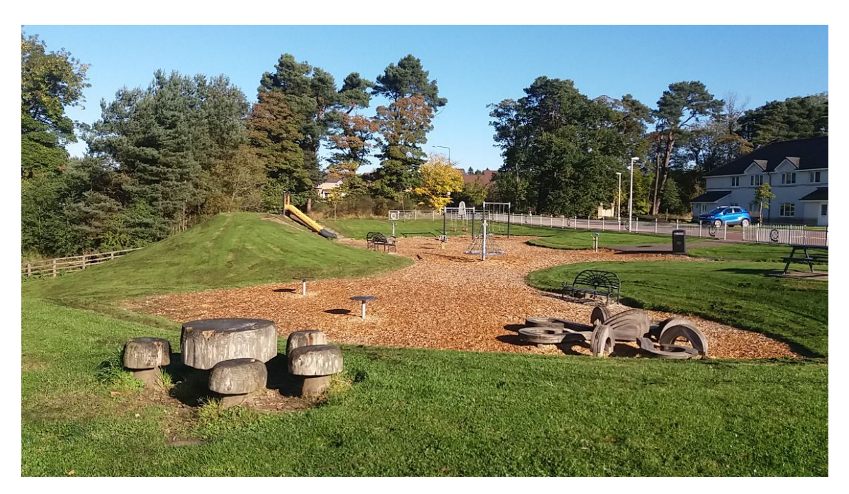
Eliburn Park Play Area, Livingston

The preparation of the original 2005 Open Space Plan involved a number of broadly sequential stages. These stages are summarised below. Further information on a number of these stages is provided later in the Open Space Plan.