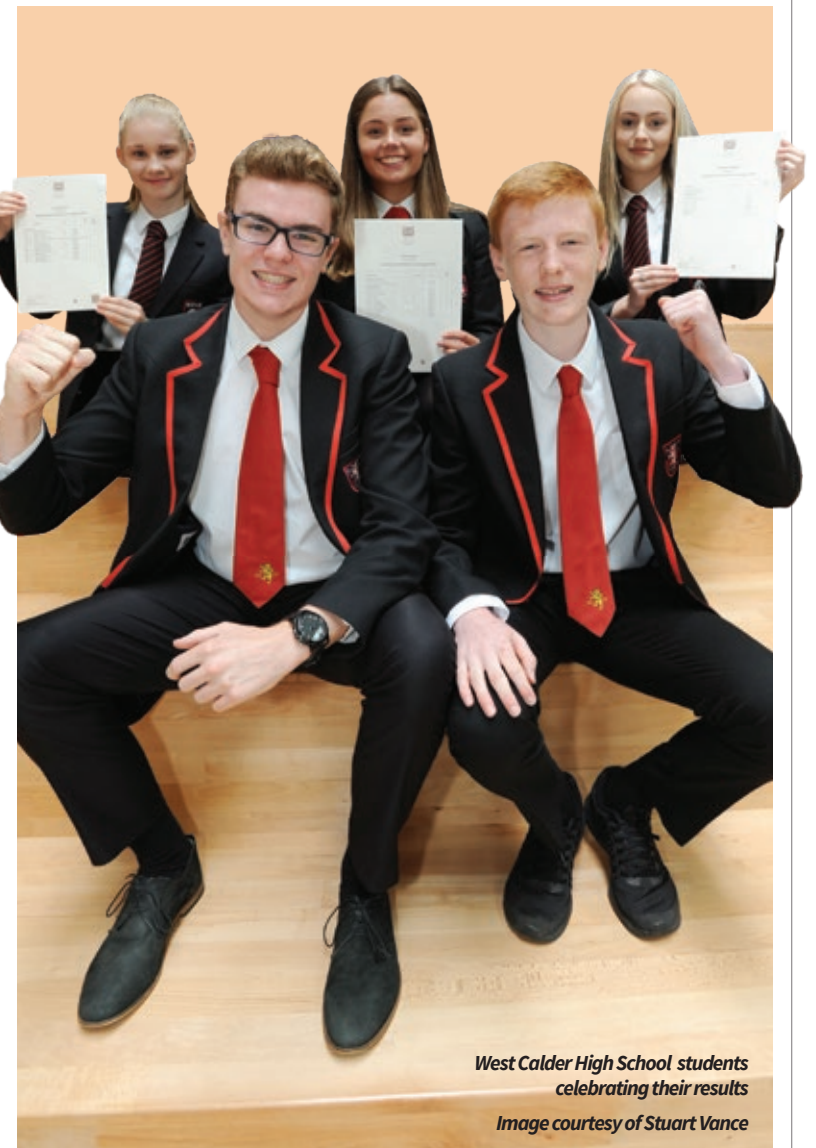
West Calder High School students celebrating their results

"I'm delighted to see exam results improve in West Lothian for a record 6th consecutive year, with the success is down to the dedication of the pupils and the quality of teaching. "It's vital we play our part to support their achievements by giving them the best possible platform for learning, such as continuing to invest in our school estate to ensure it remains one of the best in Scotland."