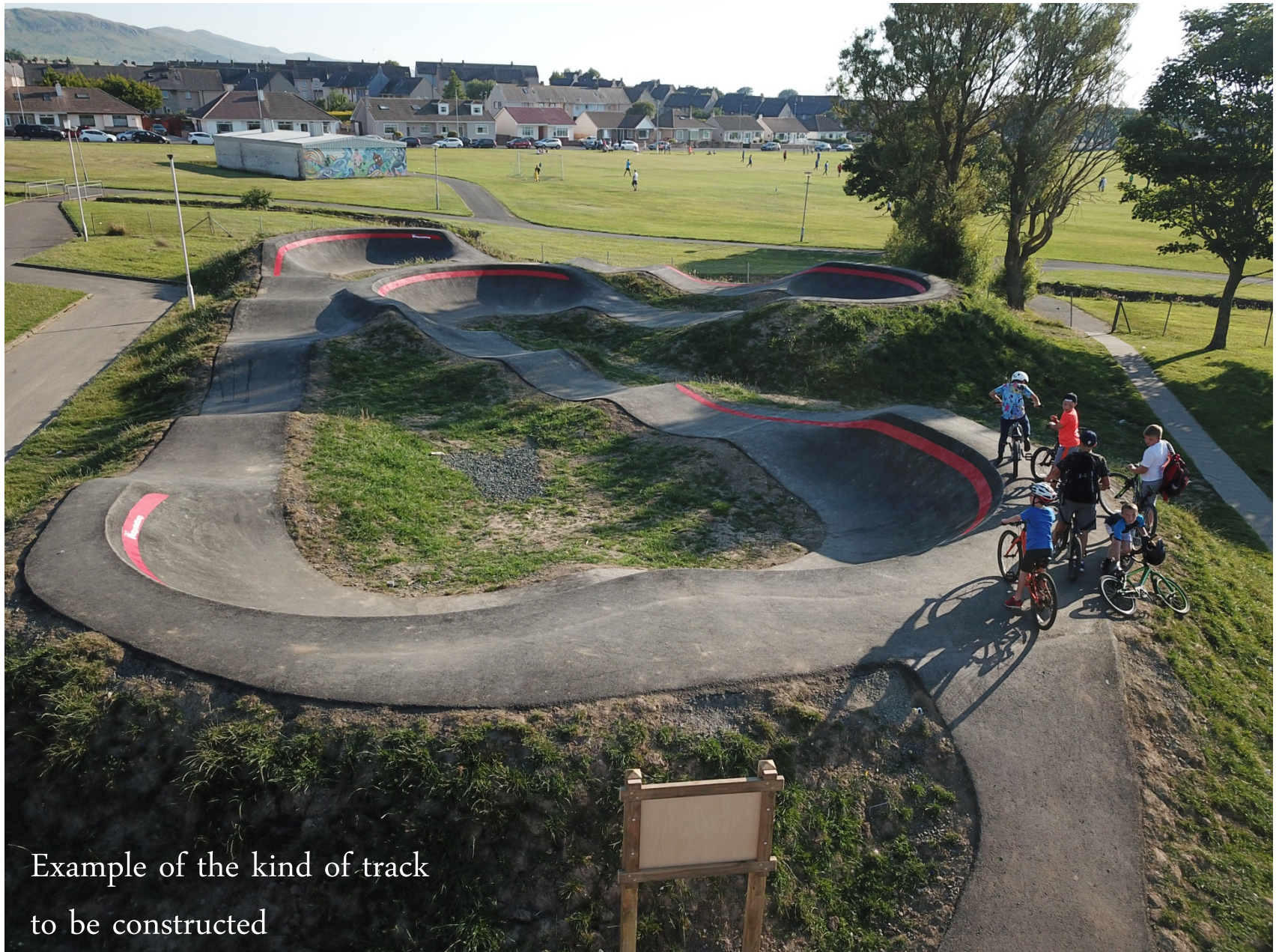
Example of the kind of track to be constructed