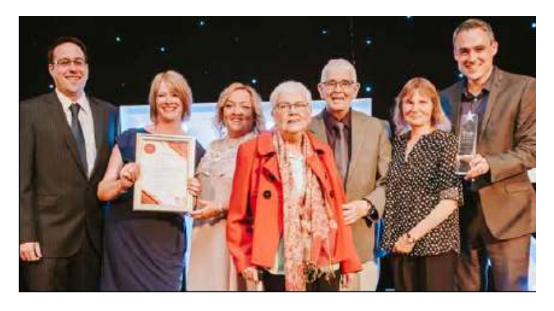
(The CP Team and Tenants Panel accepting the award)

The Service's suite of new initiatives to promote tenant participation was shortlisted for the Tenant Information Service (TIS) Excellence Awards 2017, under the Tenant Participation Excellence category. The council was successful and announced as the winner at the prestigious ceremony which took place in Glasgow on 10th June.