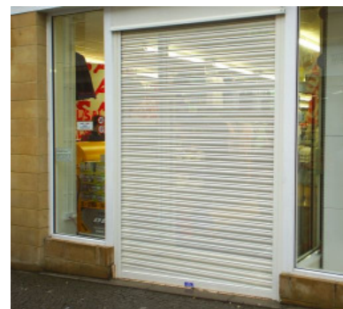
Perforated Steel 6mm Holes