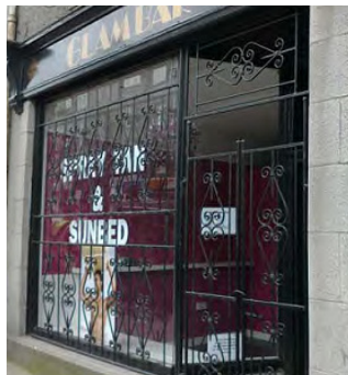
Demountable Wrought Grille