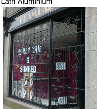
Punched Lath Steel