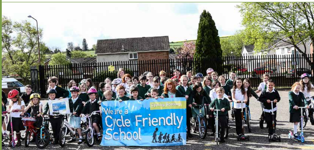
Springfield Primary School with their Cycle Friendly School banner

“Making active connections” is a plan to link people to places by active travel. It’s not just about physical connections however - it is also a framework for mainstreaming active travel in West Lothian, and creating a culture where active travel becomes the norm for everyday suitable trips. To achieve this, it is crucial that West Lothian Council works successfully with external partners and with local communities, and “joins up” policies and projects delivered across the Council.