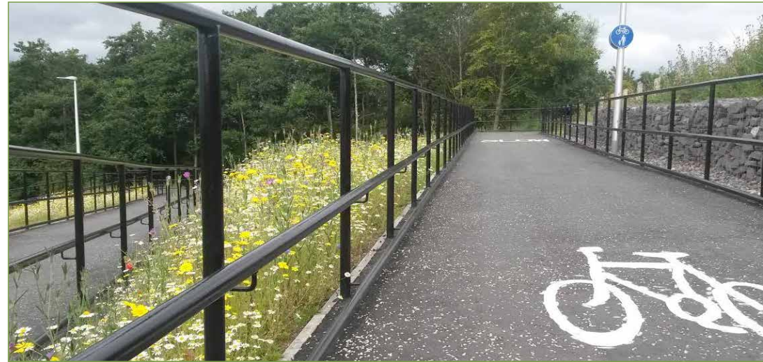
Community Links ramp connecting the NCN 754 / Canal Towpath and Linlithgow Leisure Centre, funded by Sustrans Community Links and West Lothian Council in 2015 with wildflowers planted by the local community through Burgh Beautiful and Transition Linlithgow