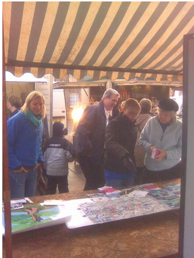
Linlithgow Farmers Market

The conversations that took place with individuals at the events was not recorded verbatim. People were encouraged to complete a postcard with their hope for 2020, either doing this at the time, or posting it back using the freepost facility.