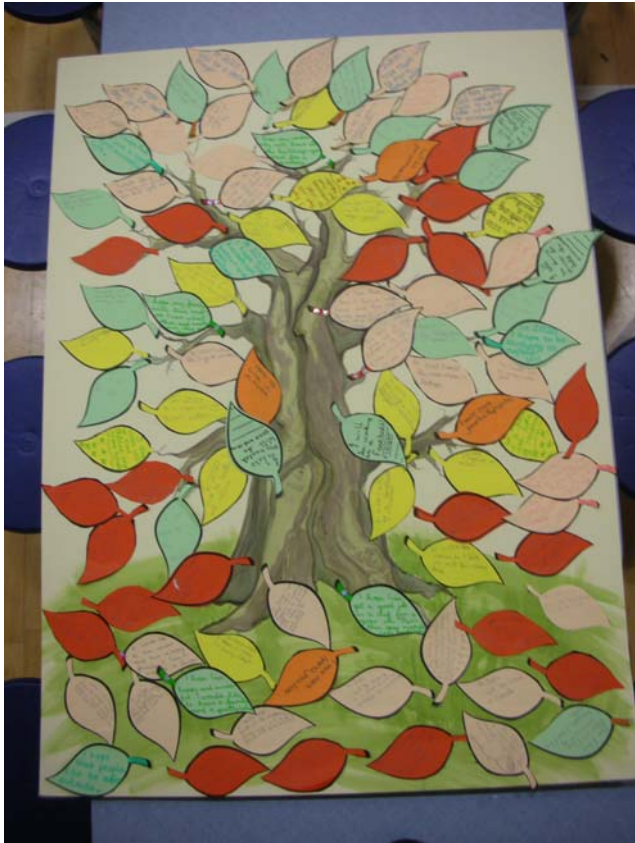
The group session with Primary 7 pupils resulted in the children creating their own tree of hope.

The debate within the groups was recorded via mind mapping. With the majority of groups we split into smaller groups of about 6 people and used paper tablecloths to record the thoughts and comments of the participants. This allowed them to see the flow of the conversation and ensured that everyone was able to contribute. The dialogue from the mind maps was distilled into key themes that emerged from the conversations