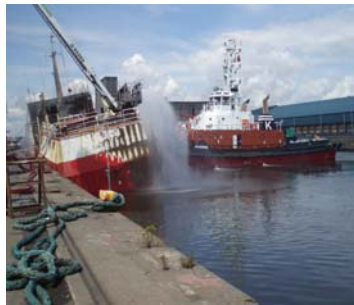
A port fire-fighting tug attempts to cool down the vessel.

applying water and evacuated personnel when the Viking Vulcan listed to port. Foam was injected twice but this failed to extinguish the fire. By mid afternoon the decision was made to allow the fire to burn itself out under the supervision of the LBFRS.