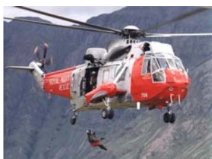
A Royal Navy Helicopter was called in to transport the walkers to safety.

The full restoration of some bridges is expected to take at least 12 months. Costs are expected to be over £1.5 million.