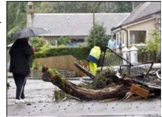
The flooding was followed by a major clean up operation

A flood prevention scheme costing £5.6m for the Brox Burn is being implemented over the next 2 years. The need for further works in light of the August flooding is being assessed at present.