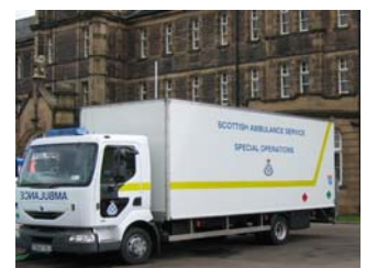
Ambulance Specialist Operation Vehicle

Training is now taking place to ensure that emergency services staff are fully prepared and an exercise will take place in 2009.